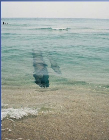
Illegal A/C drainage pipes