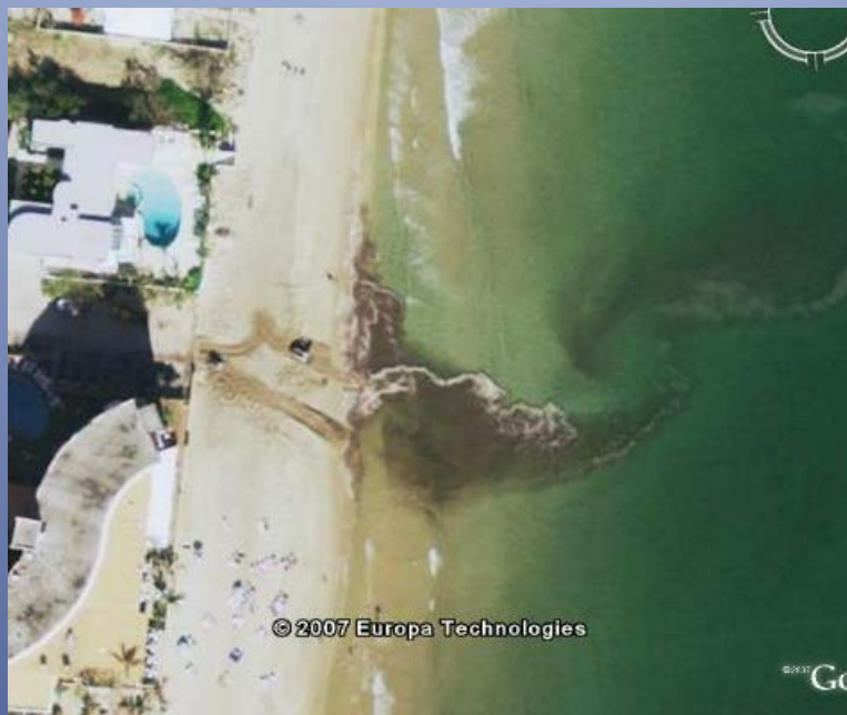
Stormwater runoff and lack of Best Management Practices on Beaches